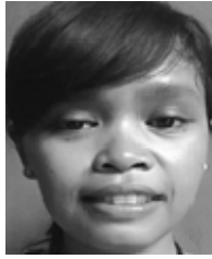
Face matrix -4