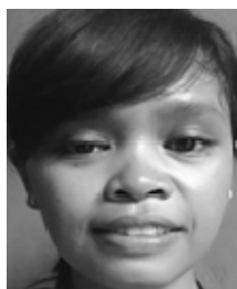
Fig. 3. Face image similar to testface image