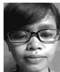
Face matrix -3