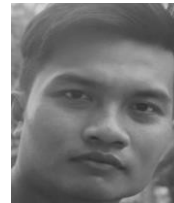
Face matrix -1