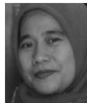
Face matrix -2